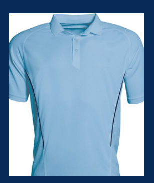
Sky Blue/Navy Polo Top This will include a Latymer Badge and student name as compulsory.