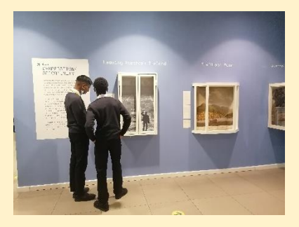
exhibit exploring 400 years of emigration from Britain from the Mayflower to the present

This trip saw a group of lucky Year 10s visit the Migration Museum in Lewisham on a cross-curricular visit. The Migration Museum explores how the movement of people to and from Britain across the ages has shaped who we are – as individuals, as communities, and as a nation. Students visited the current exhibition 'Departures' (an immersive